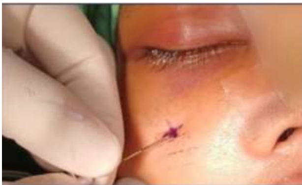
Figure 3. Infraorbital nerve block 9

For infraorbital nerve block, the end branch of the maxillary nerve, emerges about 1 cm below the middle of the lower orbital margin through the infraorbital foramen, Palpation of the infraorbital foramen, about 1 cm below the middle of the lower orbital margin. After palpating the infraorbital foramen, the needle is introduced cranially just below the palpation point until bone contact is made and then withdrawn slightly. (Figure 3). A solution of levobupivacaine 0,375% was used as a local anesthetic and dexamethasone 2,5mg as an adjuvant.