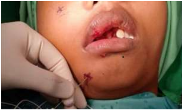
Figure 2. Mental Nerve Block 8

For infraorbital nerve block, the end branch of the maxillary nerve, emerges about 1 cm below the middle of the lower orbital margin through the infraorbital foramen, Palpation of the infraorbital foramen, about 1 cm below the middle of the lower orbital margin. After palpating the infraorbital foramen, the needle is introduced cranially just below the palpation point until bone contact is made and then withdrawn slightly. (Figure 3). A solution of levobupivacaine 0,375% was used as a local anesthetic and dexamethasone 2,5mg as an adjuvant.